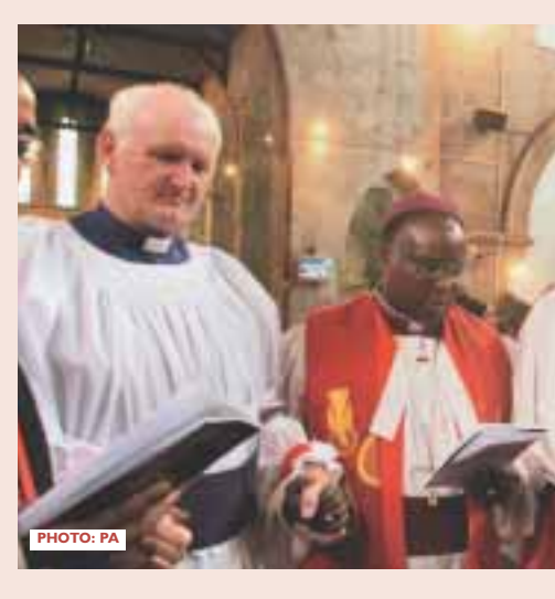
Signs of defections to come - a year ago two dispute with the US Episcopal Church over priests - were consecrated as bishops

wo significant events over the last weekend in June went largely unreported by the mass media, yet both of the events are of huge import for Christian believers; and both relate to discerning what God is doing in our age.