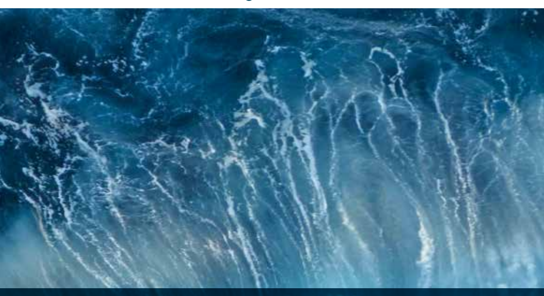
Our Religious Freedom